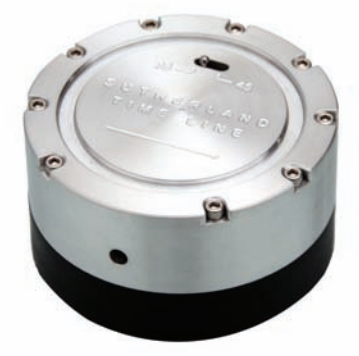
cutline (t) and (b)

The Oracle-SME-Lyra combination produced a big, slightly warm orchestral sound. String tone was rich, with a pleasing golden glow. The piano's lower register was cleanly rendered and remained well defined against the hall's reverberant field. The upper keyboard sounded supple, with a rich, woody, yet sparkling bite. Image stability and solidity were never in question, and the