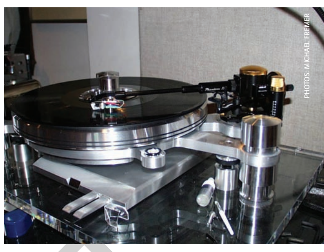
cutline (t) and (b)

silicone damping system was designed to diminish, as much as possible, all of these potential problems without reducing the spring suspension's effectiveness. It sounded as if it was working as intended. I could hear the Delphi Mk.VI with MVSS system engaged or not by rotating the three Delrin paddles in and out of the silicone and listening