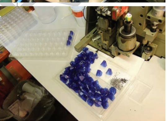
cutline (t) and (b)

facturing provided a cushion during analog's lean times. Nonetheless, cartridges still represent about 60% of Ortofon's business, with a significant portion of that being on the DJ side. The firm's heart and soul, however, remain rooted in hi-fi.